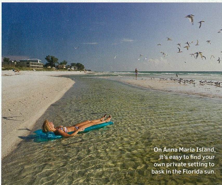
On Anna Maria Island, it's easy to find your own private setting to bask in the Florida sun.

For more information contact the Bradenton Area Convention and Visitors Bureau, www.floridagulfislands.com , or Anna Maria Island Chamber of Commerce, www.annamariaislandchamber.org or (941) 778-1541.